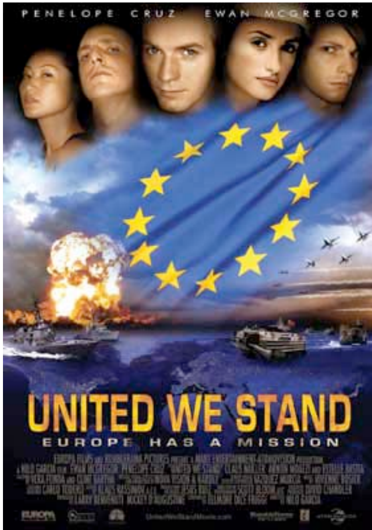
0100101110101101.org United We Stand Poster (2005) Inkjet print on paper 140 x 100 cm. Courtesy Postmasters Gallery, New York; Fabio Paris Art Gallery, Brescia

The twentieth century is over. The film industry is losing its importance in the media world, and its ability to embody, and renew, some of the great collective legends. This is why United We Stand looks faintly ridiculous, as does the European flag flying in the middle of the poster [2]. It is not the production of an actual film, but a promotional campaign for a film that doesn't exist. "Working on an imaginary film is the best way to talk about an imaginary concept: Europe", they declared [3]. The result was a massive marketing campaign which invaded public areas – with posters up around the cities of Berlin, Brussels, Barcelona, Bologna, Bangalore and New York – and media space, publicising a media object that does not exist, but that is perfectly able to generate noise. An empty space makes its presence felt by means of communication strategies, forcing us to take a long hard look at the problems with something else which doesn't exist: Europe.